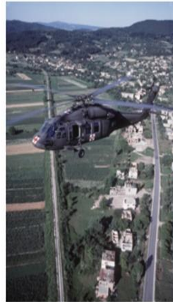
Sikorsky UH-60 Black Hawk