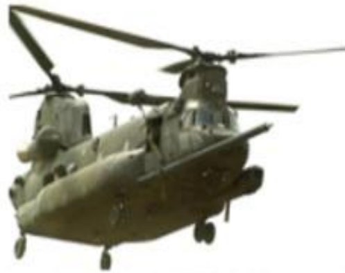
Boeing CH-47D Chinook