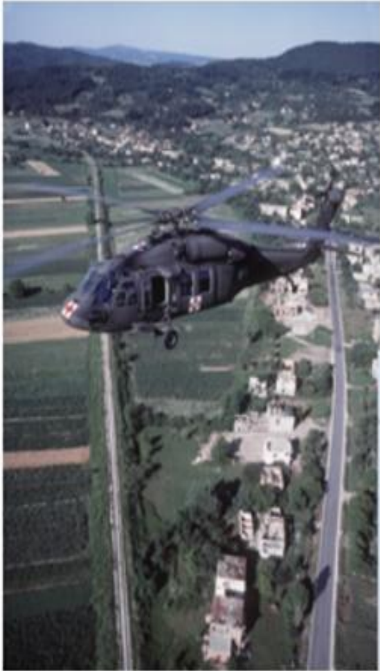
Sikorsky UH-60 Black Hawk