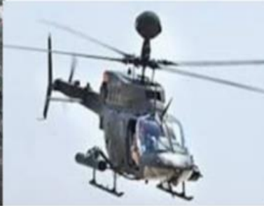
Bell OH-59D Kiowa