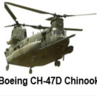
Boeing CH-47D Chinook