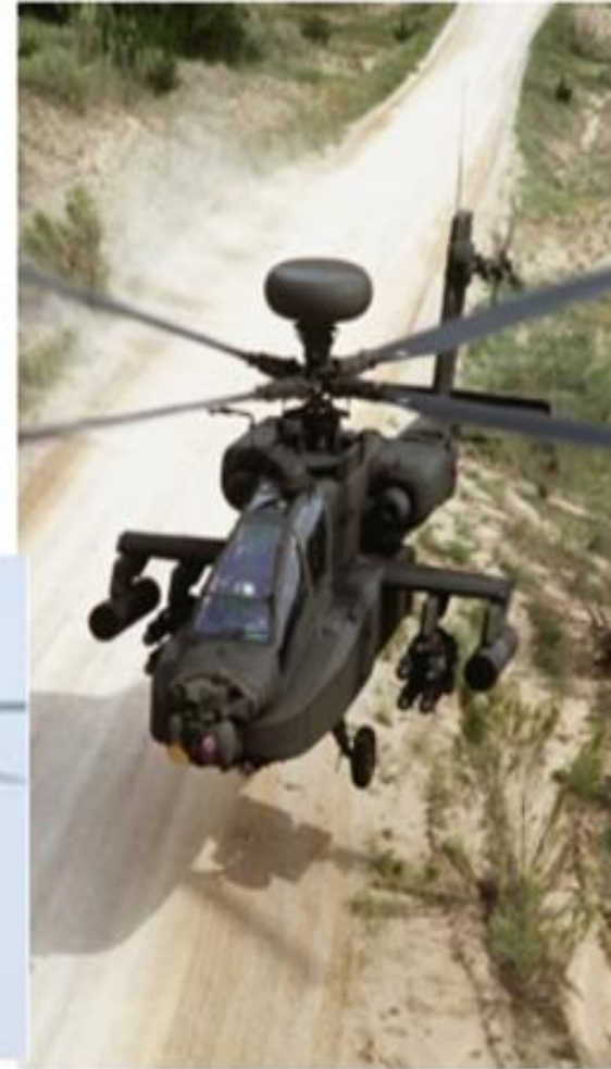
Hughes/McDonnell AH-64 Apache